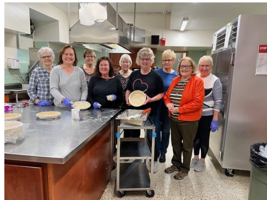
This is only one day with these women. They worked many days with several other women joining in on different days.

Thanks to Piggly Wiggly and Glenn's Market for allowing us to pick up supplies weekly!