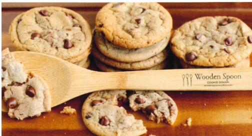
Please collect payment when taking orders.