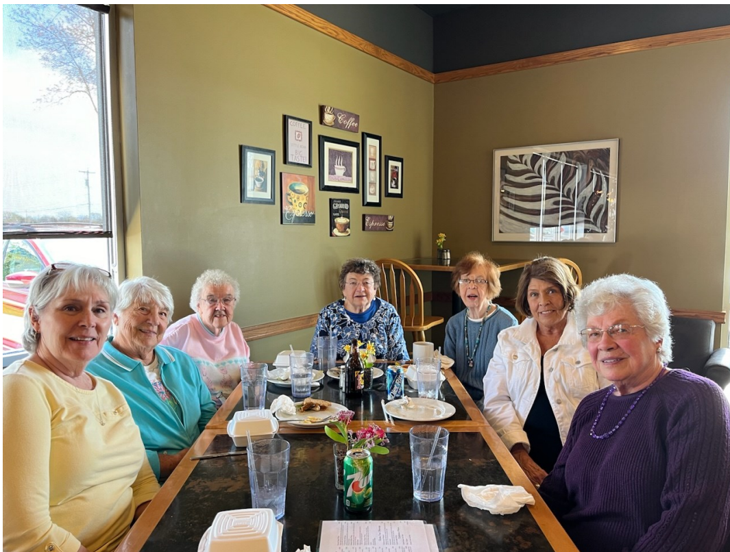
Immanuel Ladies Lunch Bunch at Connections Café in Watertown in April.

I.L.L.B. will meet again this month on Tuesday, May 28th at Schwefel's in Oconomowoc. Please call the church office by Friday, May 25th, so we know how many reservations to make. Meet in the church parking lot at 11:00am on Tuesday to carpool.